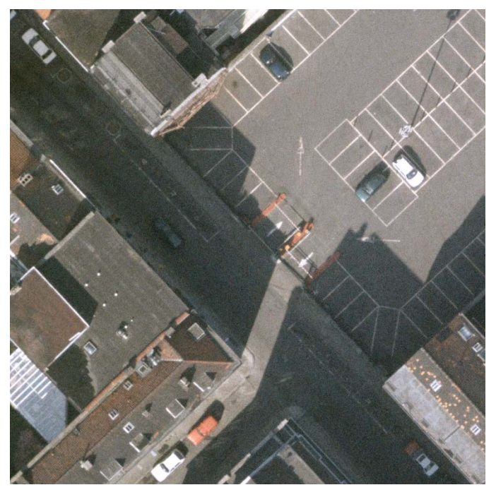
CLEANED IMAGE - NO DUST AND SCRATCHES

The image is scanned twice – once with RGB light and once with IR light. The IR image is used to detect exactly where and what is foreign from the original image. Software then utilizes surrounding image information to remove the foreign matter from the original RGB image.